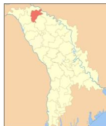
Photo: geographical location